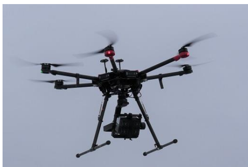
The M400 system mounted on a drone.

Integrate H3D's detector module into your product. This box contains everything you need for high-resolution spectroscopy.